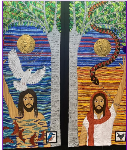
Jesus' baptism and temptation