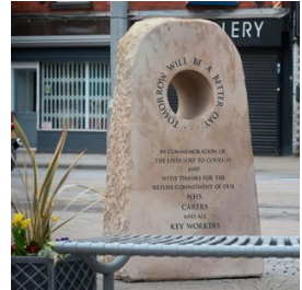
The Covid memorial in Arnold

I gave our church community an opportunity to record their memories and reflections of the pandemic in the Sunday service on the 20 th November 2022. I then spoke to the young people on a following Sunday and gave them a similar opportunity. The church community contributed over 100 sentences in total