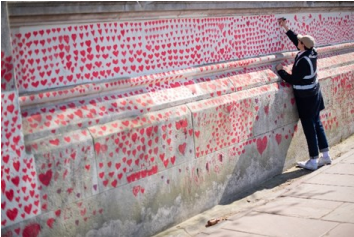
A volunteer draws another heart on the Covid memorial in London

There are many ways in which different communities have remembered and reflected upon their experiences in the pandemic. Some communities installed sculptures, some memorials consist of flags or ribbons, and some are a direct record of people's experiences. As I write this the COVID Inquiry is due to start tomorrow, and many people will have composed "pen portraits" of their loved ones who died in the pandemic that will be included in some form in the Inquiry. At the start of the Inquiry a video consisting of interviews with several of the bereaved will be shown.