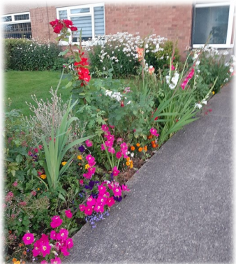
Ricky's colourful garden