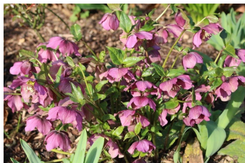
and at Holme Pierrepont Hall