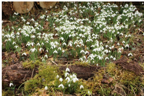
taken at Dimmingsdale Nature Reserve , near Calke Abbey