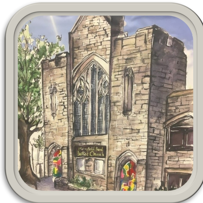
Mansfield Road Baptist Church